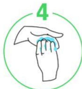
The back of the fingers