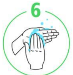
The tips of the fingers