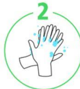
The backs of hands