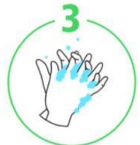
In between the fingers